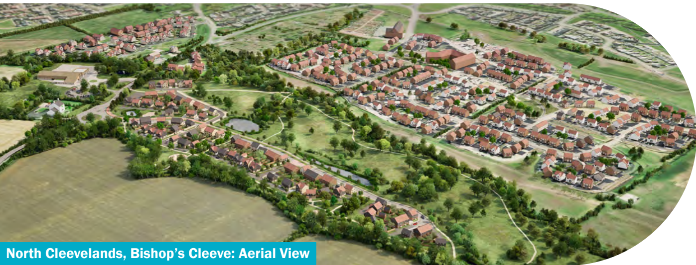
North Cleavelands, Bishop's Cleeve: Aerial View