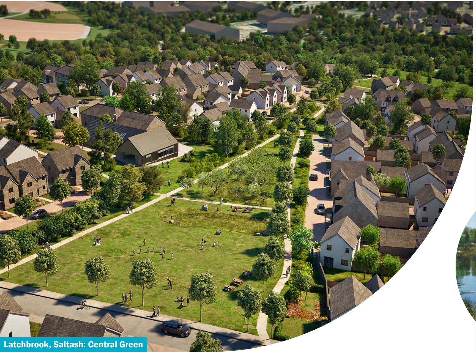
Latchbrook, Saltash: Central Green