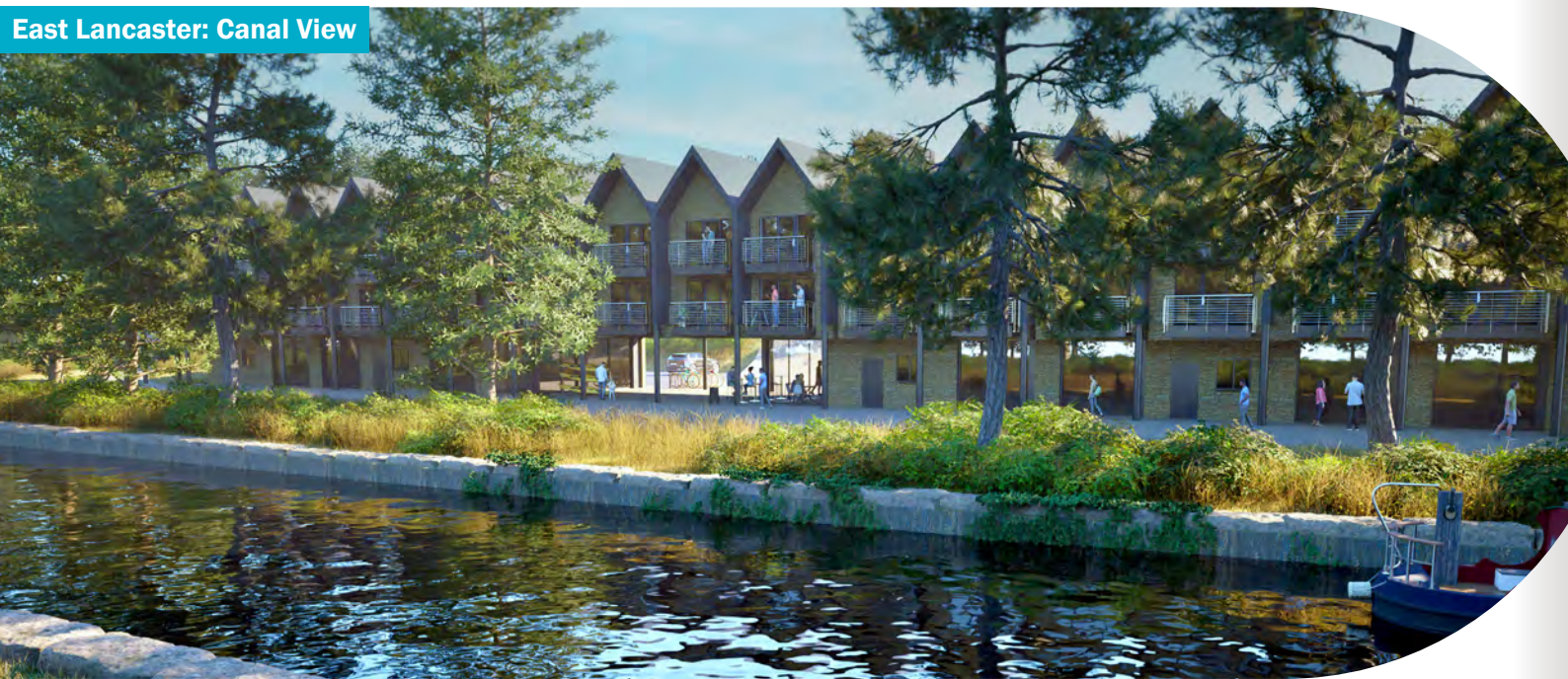
East Lancaster: Canal View