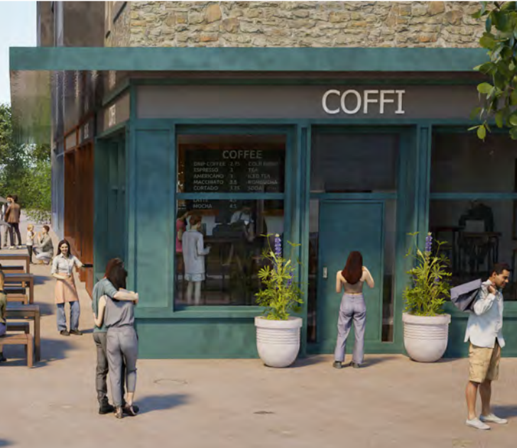
Upper Cosmeston Farm, Penarth: Neighbourhood Centre