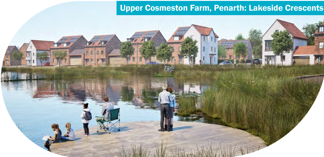
Upper Cosmeston Farm, Penarth: Lakeside Crescents

Join us at EDP, where your vision meets our expertise, and together, we create places that inspire and thrive.