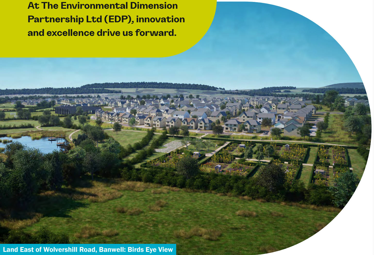
Land East of Wolvershill Road, Banwell: Birds Eye View

At The Environmental Dimension Partnership Ltd (EDP), innovation and excellence drive us forward.